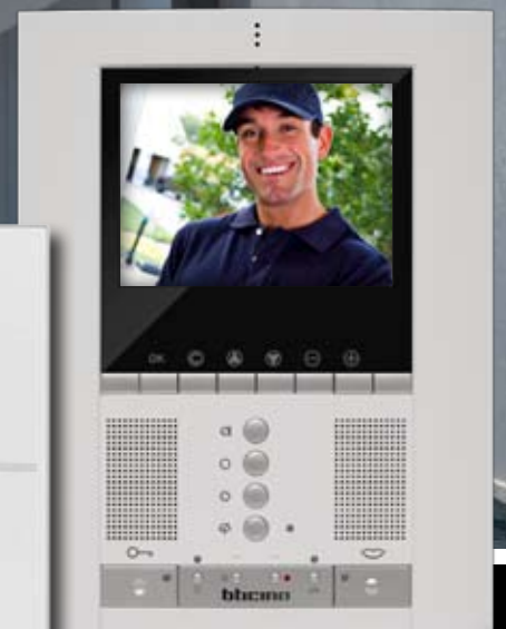
Polyx Memory Station